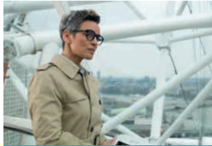
ZEISS Individual® 2

VSP® members can earn $35 back on the purchase of ZEISS Premium Progressive eyeglass lenses.