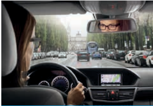
ZEISS DriveSafe Individual