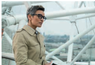
ZEISS Individual® 2

VSP® members can earn $35 back on the purchase of ZEISS Premium Progressive eyeglass lenses.