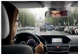
ZEISS DriveSafe Individual